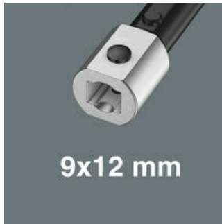
With safety pin

For torque wrenches of the Click-Torque X series with 9x12 mm holder.